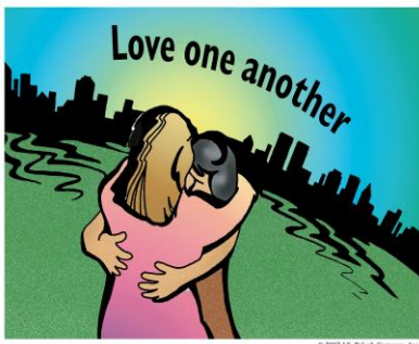
© 2007 J.S. Paluch Company, Inc.