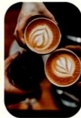
VARIETY OF BEVERAGES

RAFFLES CAN BE PURCHASED IN ADVANCE AT LYNNE'S CARDS & GIFTS