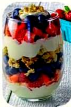
YOGURT PARFAIT BAR