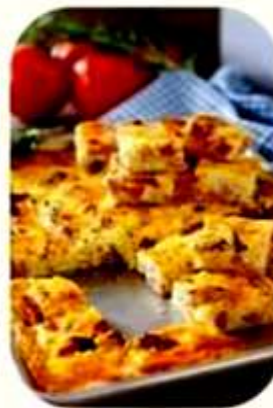
3 CHOICES OF QUICHE