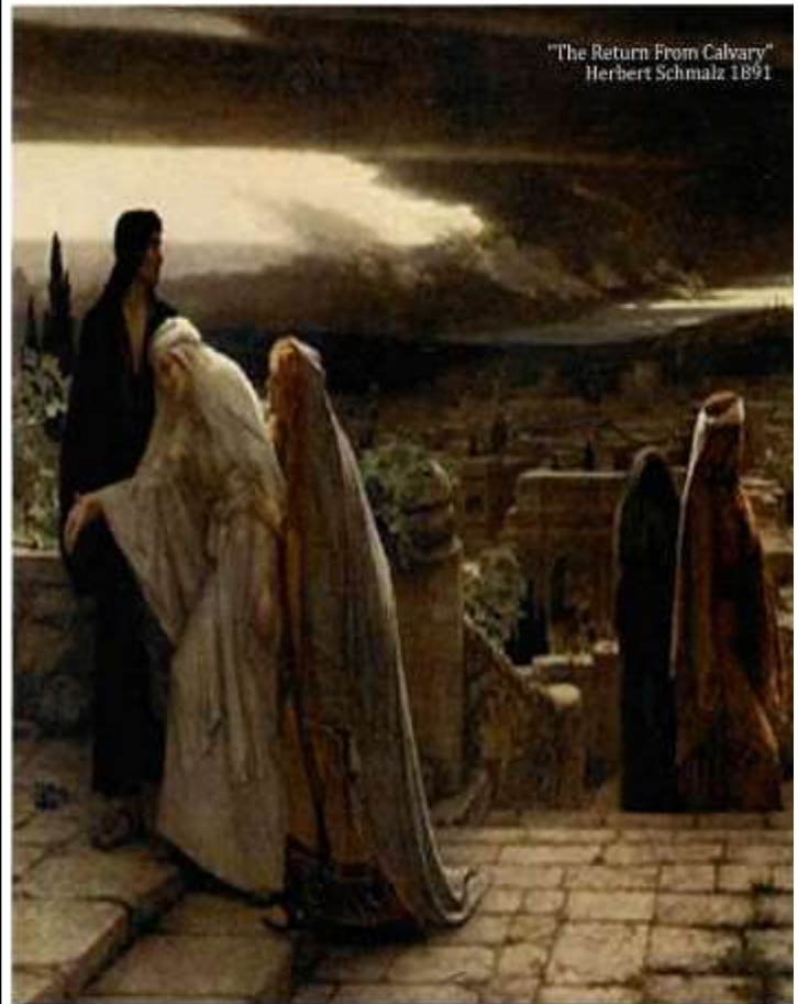
"The Return From Calvary" Herbert Schmalz 1891