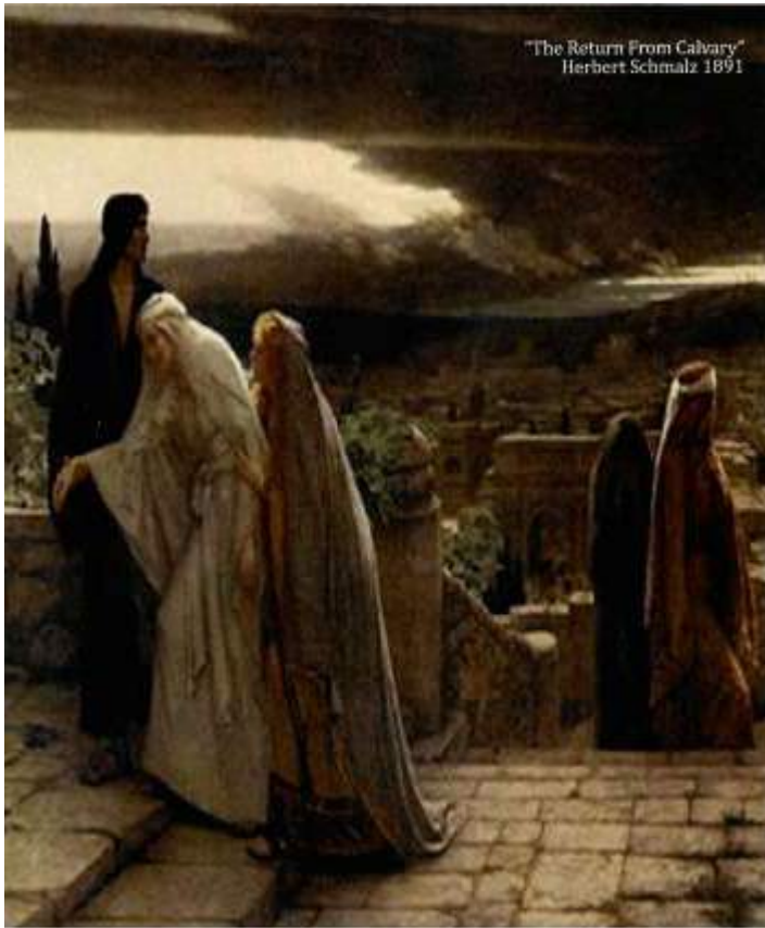
"The Return From Calvary" Herbert Schmalz 1891